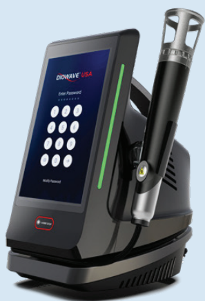
Diowave 50WLS - 810nm