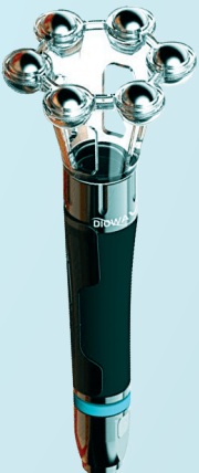
Roller Ball Extension Handpiece