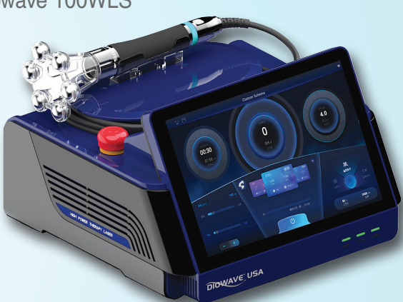
Diowave 25-50WLS – 810nm