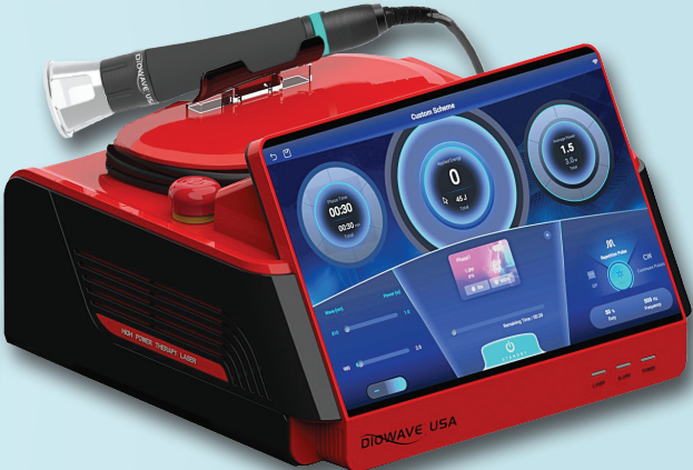
Diowave 100 WLS – 810nm